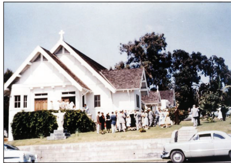
St. James Church circa 1950.

stories, photos, and mementos to commemorate the 100th anniversary. Please stop by the library to share your memories.