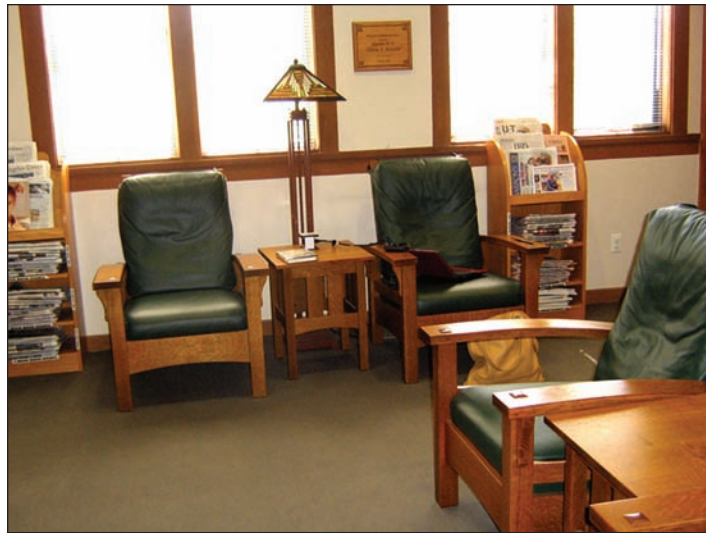
New chairs purchased by the Friends of the Del Mar Library. Nice place to use the WIFI.