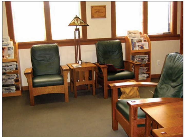
New chairs purchased by the Friends of the Del Mar Library. Nice place to use the WIFI.