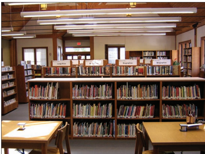
New lower stacks which allow more light and visibility in the library.